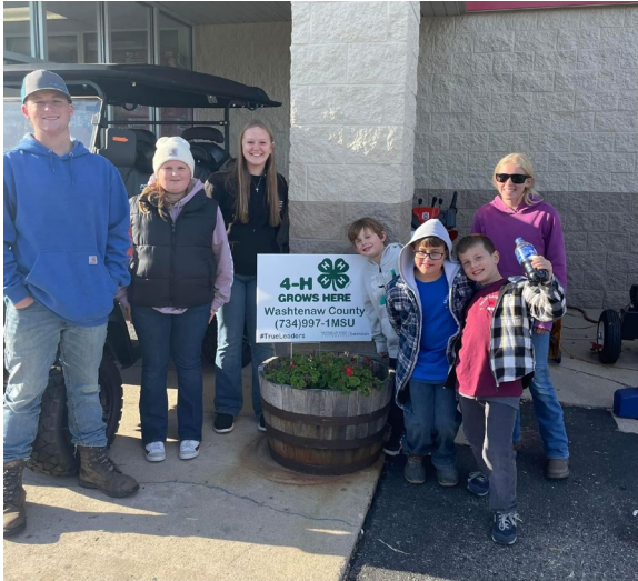
Saline 4-H Farmers selling clovers outside Saline Tractor Supply Company to raise funds for Washtenaw County 4-H