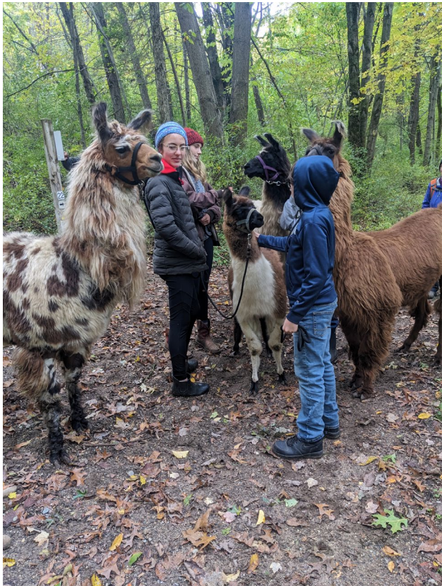
Double L Llama 4-H Club on their annual Fall Hike with the llamas