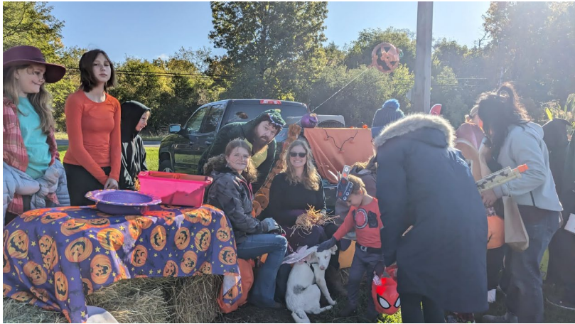
S & L Bauernhof 4-H Club participated in the Whitmore Lake Trunk or Treat. They served over 150-200 youth and their families and spread the word about 4-H