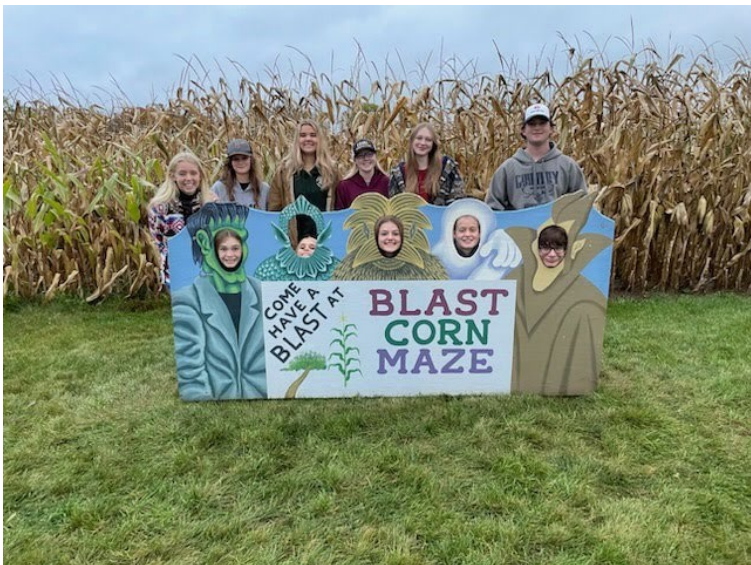
Junior Livestock members taking on the Blast Corn Maze at their meeting